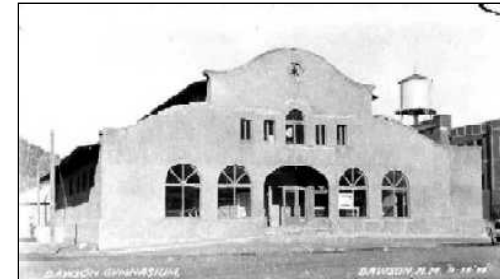
Dawson Amusement Hall, 1920's