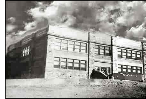
Dawson Douglas School, 1920's

Observance of the above don'ts will make for mine efficiency and will bring the satisfaction of having done a day's work for a day's pay