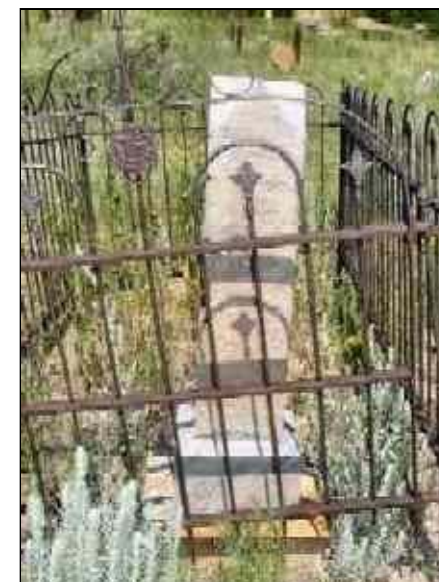
Many immigrants worked at the Dawson Mine. This headstone is written in Chinese.