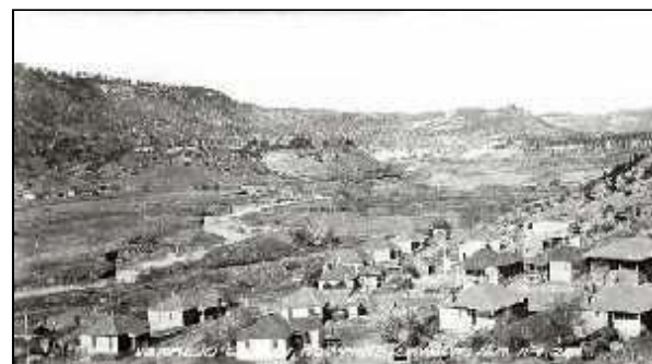
Dawson , 1920's, Dwight and Carol Myers Collection, NMSU

Driving Directions: Highway 64 northeast from Cimarron for 10 miles to the old Dawson road. Turn left (north) for five miles on dirt road. From Colfax, drive across the bridge toward Raton and turn left. The locked gate into Dawson is 4.5 miles from the highway. The cemetery is 0.2 miles from the locked gate back around to the right. It is open to the public.