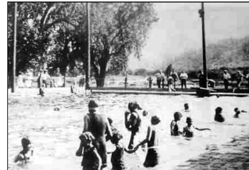
Dawson Swimming Pool, 1920's, New Mexico Wanderings