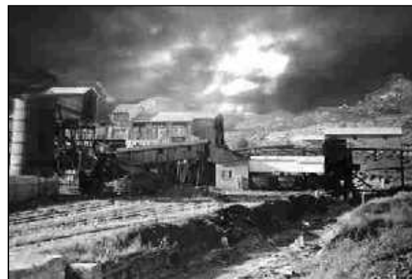
Dawson Mine Buildings, 1920's, New Mexico Wanderings