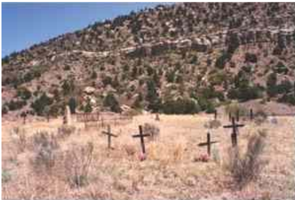
Dawson Cemetery