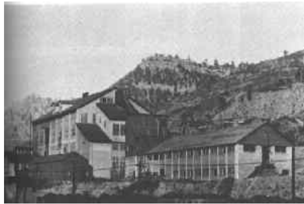
Dawson Coal Washer, Circa 1925

In 1901 the Dawson coal mine opened and a railroad was constructed from Dawson to Tucumcari and the town was born. Then in 1906, the Phelps Dodge company bought the mine and increased development. Dawson went on to have its own newspaper, the Dawson News, a theater, hotel, modern homes, hospital, baseball park, golf course, bowling alley and more. Dawson's high school basketball and football teams went on to win many awards. Then disaster struck, not once, but twice. On October 22, 1913 at 3:10 P.M., an explosion in the mine killed 263 minors plus two rescuers. Then on February 8, 1923 at 2 P.M., another explosion killed 120 men. Surprisingly though, the town didn't die, but rather went on until the mine was closed down in 1950. When the mine closed, Phelps Dodge sold the whole town, buildings and all, to be carried off to other locations. Today, the cemetery is the main thing to see at Dawson.