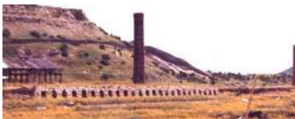
Dawson