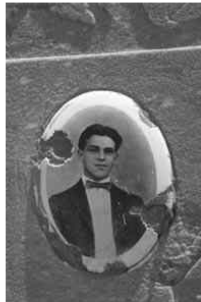
Marker - 1901 to 1922